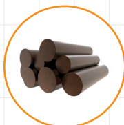
Decorative Steel Logs