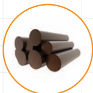
Decorative Steel Logs